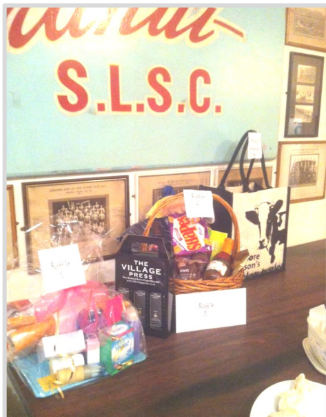
The raffles—donated by the community.

A quick tally looks like the night raised over $1,300 towards the Pool Champs trip—a wonderful effort all round. Final thanks must go to the sponsors for the evening for their generous contributions – please support these organisations when you can as they just keep on supporting Maranui