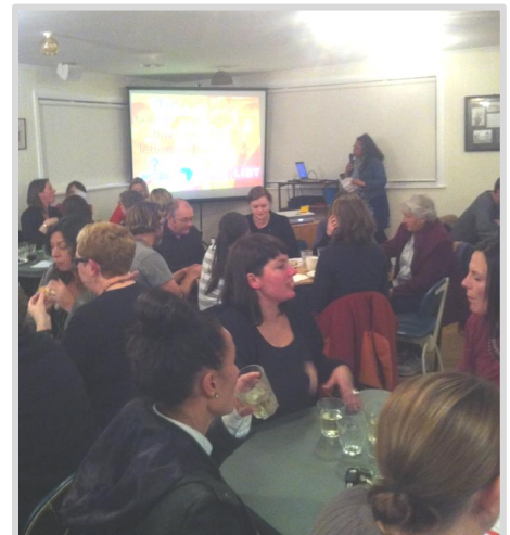
“Who knows the answer to that one?”